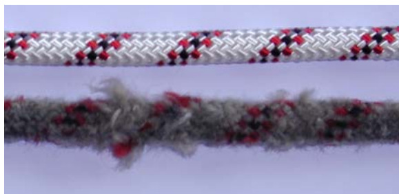
Fig. 2: Severe rope wear, wear with rope thickening

The rope must be visually/manually checked along its entire length for the following wear appearance /defects / damage: Cuts, fibre breaks thickening, loops kinks, knots rot, burns severe wear/abrasion open, loosened termination sheath displacement