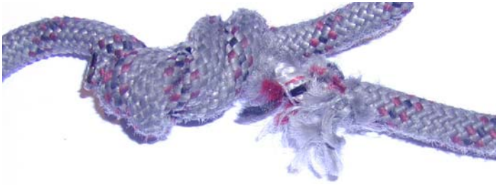
Fig.1: fibre breaks

The rope must be visually/manually checked along its entire length for the following wear appearance /defects / damage: Cuts, fibre breaks thickening, loops kinks, knots rot, burns severe wear/abrasion open, loosened termination sheath displacement