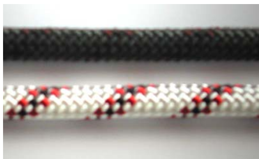
Fig.3: Blackening of the rope due to brake dust

The device must be withdrawn from use if it shows one of the aforementioned properties.. The rope must be replaced by the manufacturer or a person authorised by the manufacturer.